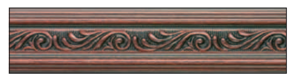
floral shown here in mahogany